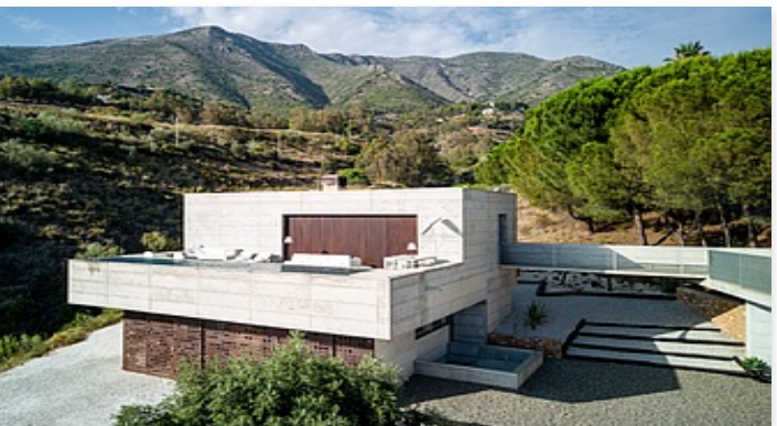
Luxury contemporary villa with minimalist design in the Valtocado Urbanization, Mijas